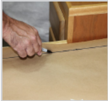
5 -Follow with pencil.