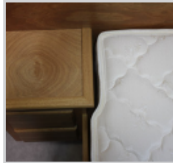
7 - If so, a notch or additional finger space can be added.