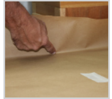
4 - Crease paper with finger.