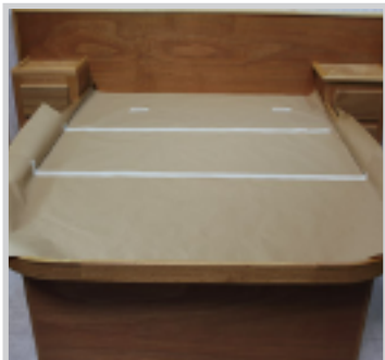
13 - Roll out 3rd layer of paper, tape down to 2nd layer.