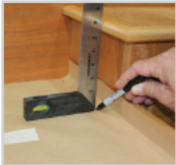
9 - Draw a small line at base of square every few inches around the perimeter of nightstand.