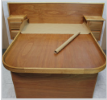
1 - Remove old mattress, clear off platform. Roll out paper across the Headboard or Bulkhead.