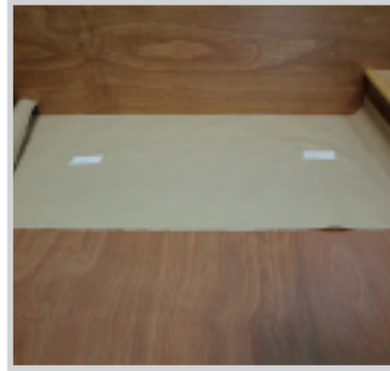
3 - Tape paper down. Be sure to keep edge of paper even with Headboard or Bulkhead.