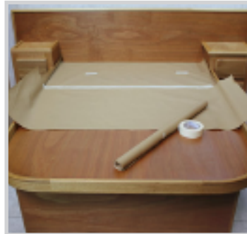
11 - Roll out 2nd layer of paper, tape down to 1st layer.