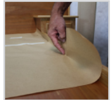
12 - Crease edges with finger and follow with a pencil.