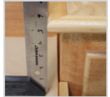
8 - To measure, place a square against the over hang.