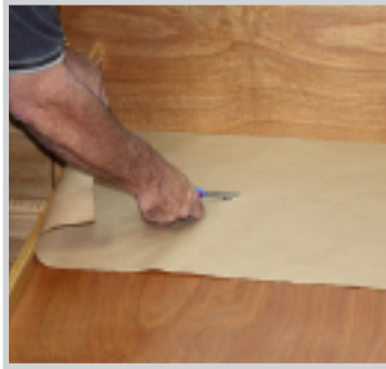
2 - Cut small V-Slits on each side.