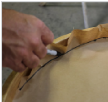
14 - Crease the edges into the corner and finish with a pencil.