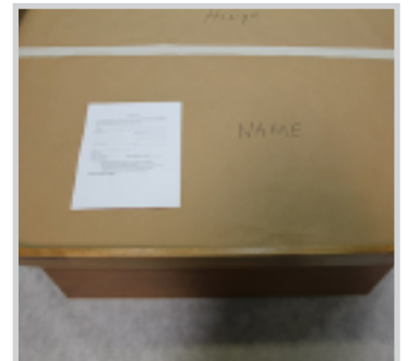
16 - Once pattern is complete, be sure to put your name and phone number on it and send it to your nearest location.

ONCE WE RECEIVE IT, WE WILL CONTACT YOU WITH ANY QUESTIONS & CONFIRM PRICING. YOU CAN USE A CREDIT CARD OR PAY BY CHECK.