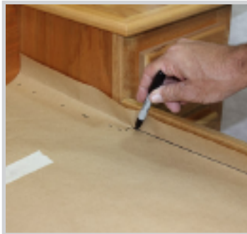
10 - Crease paper in remaining area and follow with a pencil.